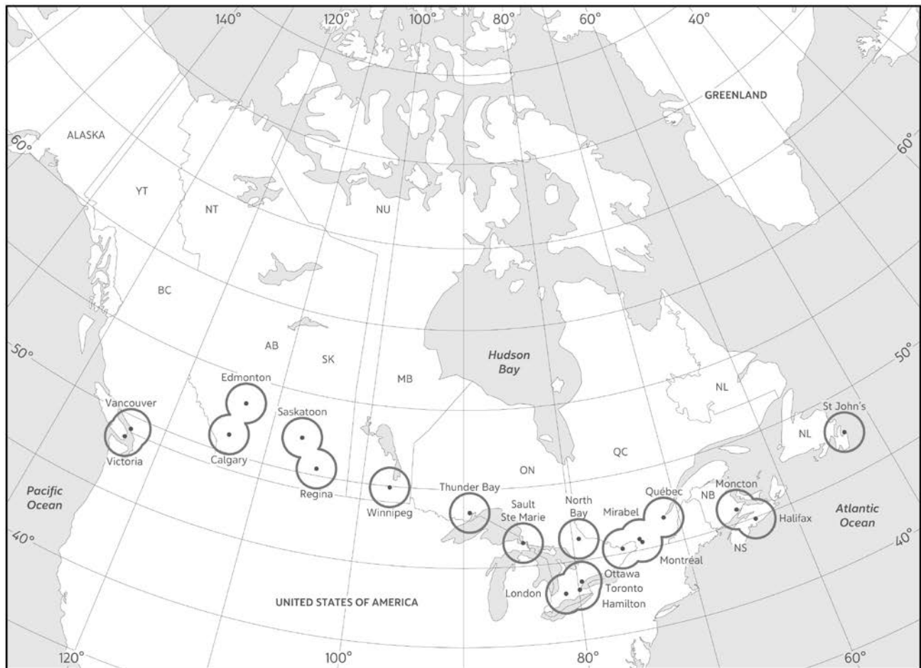
Figure 1.6.1, Primary Radar Coverage.