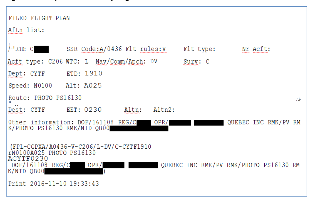
Figure 1- Sample Photo Survey Flight Plan