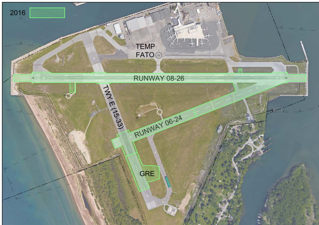
Figure 2: June 2016 to October 2016 construction changes.